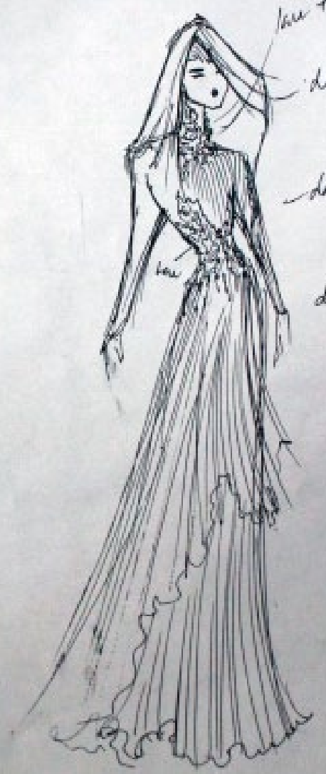
Above: eveningwear gown designs 2013. Left: RTW design 2012.

lace + sharp details deep burnt red large dark blue the lower dark blue